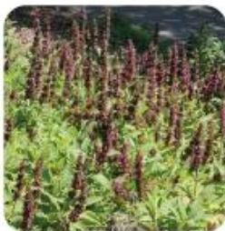
SALVIA SPATHACEA HUMMINGBIRD SAGE