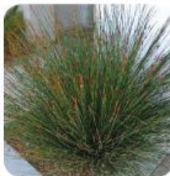
CHONDROPETALUM TECTORUM 'EC' SMALL CAPE RUSH