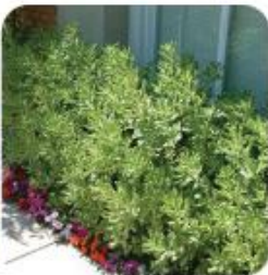
PITTOSPORUM T. VARIEGATA VARIGATED MOCK ORANGE