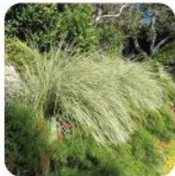
LOMANDRA L. PLATINUM BEAUTY VARIEGATED DWARF MAT RUSH