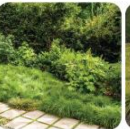
CAREX DIVULSA EUROPEAN GRAY SEDGE