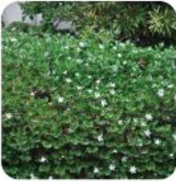
CARISSA MACROCARPA 'GC' GREEN CARPET NATAL PLUM