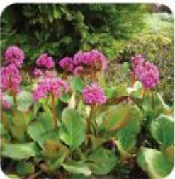
BERGENIA CORDIFOLIA HEARTLEAF BERGENIA