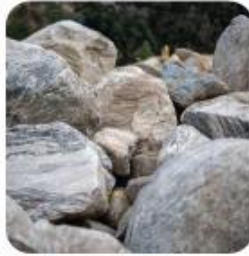
DECORATIVE BOULDERS DESERT MARBLE