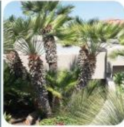
CHAMAEROPS HUMILIS MEDITERRANEAN FAN PALM