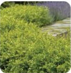
BUXUS MICROPHYLLA 'WG' WINTER GEM BOXWOOD