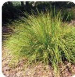
LOMANDRA LONGIFOLIA 'BREEZE' DWARF MAT RUSH