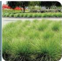
FESTUCA MAIREI MAIRE'S FESCUE