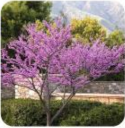
CERCIS CANADENSIS 'FOREST PANSY'