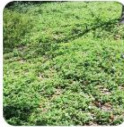
FRAGARIA CHILOENSIS BEACH STRAWBERRY