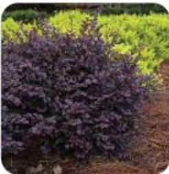
LOROPETALUM CHINENSE VAR. RUBRUM CRIMSON FIRE LOROPETALUM