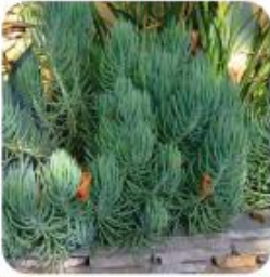
SENECIO VITALIS NARROW-LEAF CHALKSTICKS