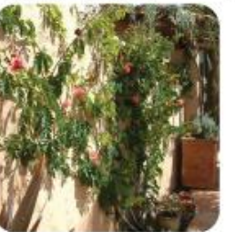
CALLIANDRA HAEMATOCEPHALA PINK POWDER PUFF