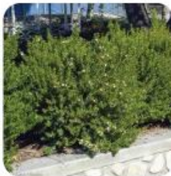
MYRTUS COMMUNIS 'COMPACTA' DWARF MYRTLE