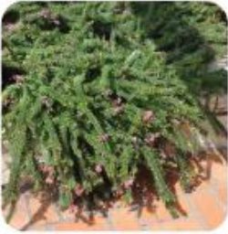
GREVILLEA LANIGERA 'COASTAL GEM' LOW GROWING WOOLLY GREVILLEA