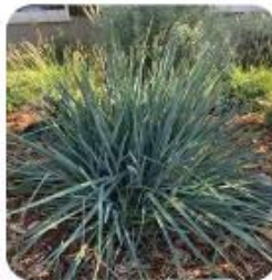
DIANELLA CAERULEA 'CASSA BLUE' BLUE FLAX LILY