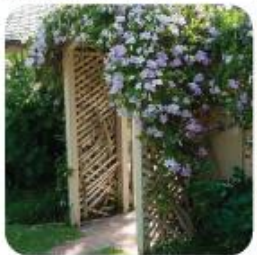
CLYTOSTOMA CALYSTEGIOIDES LAVENDER TRUMPET VINE