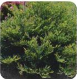
DISTYLIUM 'BLUE CASCADE' BLUE CASCADE EVERGREEN