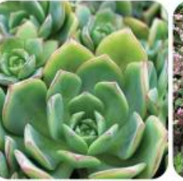
AEONIUM HAWORTHII PINWHEEL