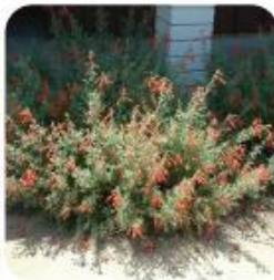
ERIOBOTHUM CANUM 'CALISTOGA' CALIFORNIA FUCHSIA