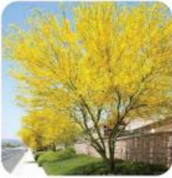
PARKINSONIA X 'DESERT MUSEUM' DESERT MUSEUM PALO VERDE