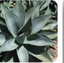
AGAVE ATTENUATA 'BOUTIN BLUE' BLUE FOX TAIL AGAVE