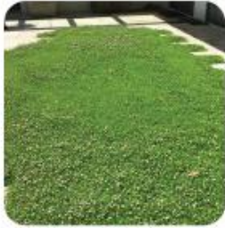
PHYLIA NODIFLORA KURAPIA