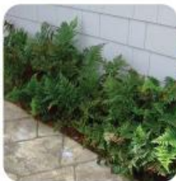
RUMOHRA ADIANTIFORMIS LEATHERLEAF FERN