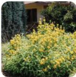
PHLOMIS FRUTICOSA JERUSALEM SAGE