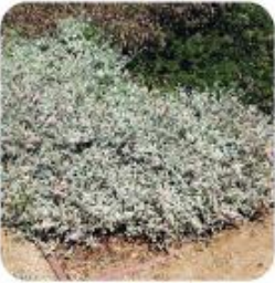
LESSINGIA FILAGINIFOLIA 'SC' SILVER CARPET BEACH ASTER