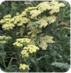
ACHILLEA 'ANTHEA' ANTHEA YARROW