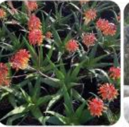
ALOE 'ROOIKAPPIE' LITTLE RED RIDING HOOD ALOE