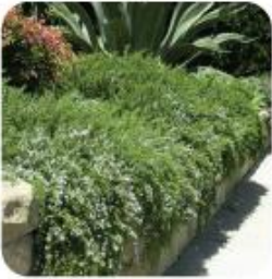
ROSMARINUS OFFICINALIS 'HC' HUNTINGTON CARPET RESEMARY