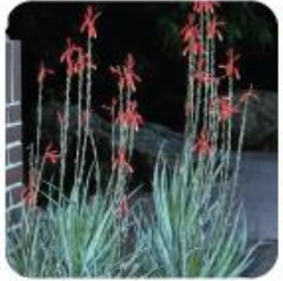
ALOE 'BLUE ELF' BLUE ELF ALOE