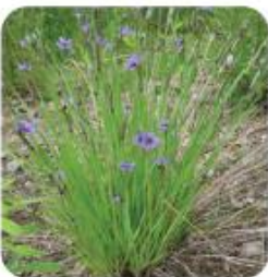
SISYRINCHIUM MONTANUM STRICT BLUE-EYED GRASS