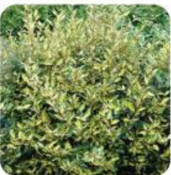
ELAEOGNUS PUNGENS 'VARIEGATED' CLEMSON VARIEGATED SILVERTHORN