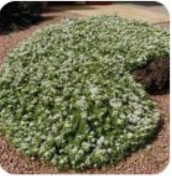
MYOPORUM PARVIFOLIUM 'FL' FINE-LEAF GROUNDCOVER MYO-