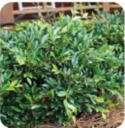
DISTYLIUM 'VINTAGE JADE' VINTAGE JADE DISTYLIUM