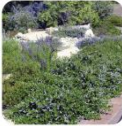
CEANOTHUS GRISAEUS VAR. HORIZ. 'YP' YANKEE POINT CEANOTHUS