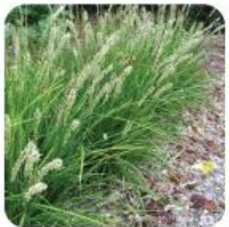
SESLERIA AUTUMNALIS AUTUMN MOOR GRASS