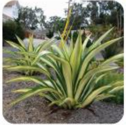
FURCRAEA FOETIDA VARIEGATA FALSE AGAVE