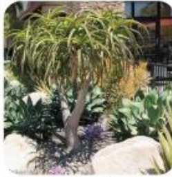
ALOIDENDRON BARBERAE ALOE TREE