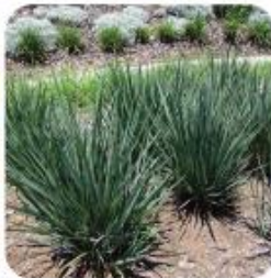
DIANELLA REVOLUTA 'LITTLE REV' LITTLE REV FLAX LILY