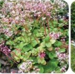
CRASSULA MULTICAVA FAIRY CRASSULA