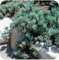
SENECIO SERPENS BLUE CHALKSTICKS