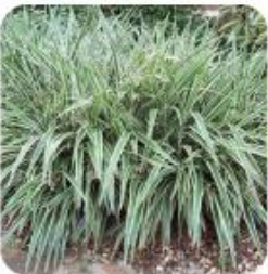
DIANELLA TASMANICA VARIEGATA WHITE STRIPED TASMAN FLAX