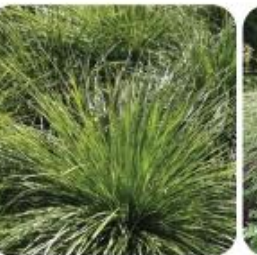
CAREX TUMULICOLA FOOTHILL SEDGE