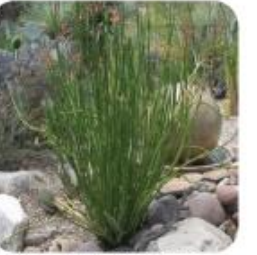
PEDILANTHUS BRACTEATUS TALL SLIPPER PLANT