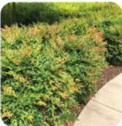
NANDINA DOMESTICA 'GULF STREAM' GULF STREAM HEAVENLY BAMBOO