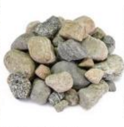
DECORATIVE COBBLE SIERRA