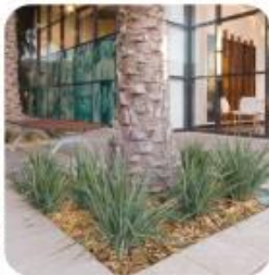
DIANELLA REVOLUTA 'ALLYN-CITATION' COOLVISTA DIANELLA