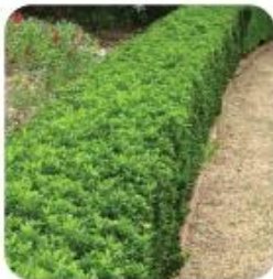
EUONYMUS J. 'MICROPHYLLUS' BOXLEAF EUONYMUS