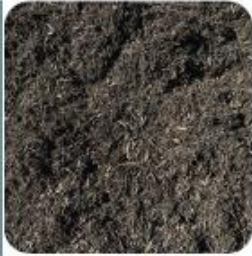
ORGANIC MULCH FOR PLANTERS IRVINE BLEND