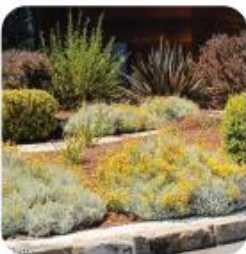
SANTOLINA CHAMAECYPARISSUS LAVENDER COTTON