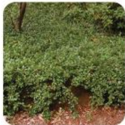
COTONEASTER DAMMERI 'LOWFAST' BEARBERRY COTONEASTER