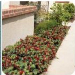
CALLISTEMON 'LITTLE JOHN' LITTLE JOHN BOTTLEBUSH