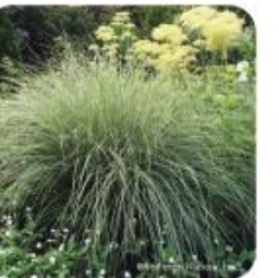
MISCANTHUS SINENSIS 'ML' MORNING LIGHT MAIDEN GRASS