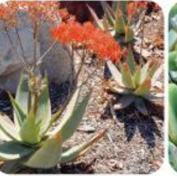
ALOE STRIATA CORAL ALOE