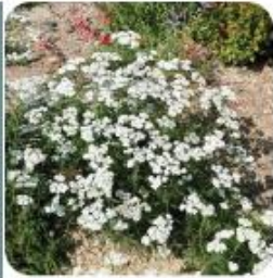
ACHILLEA MILLEFOLIUM YARROW