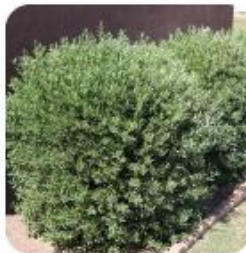
OLEA EUROPAEA 'MONTRA' LITTLE OLLIE DWARF OLIVE