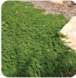
MYOPORUM PARVIFOLIUM 'PC' MYOPORUM 'PUTAH CREEK'