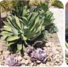
AGAVE 'BLUE FLAME' BLUE FLAME AGAVE