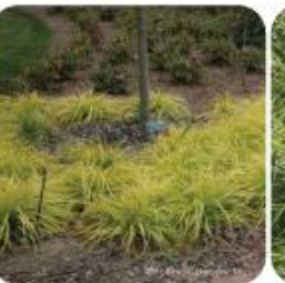
CAREX OSHIMENSIS 'EVERILLO' CAREX EVERCOLOR EVERILLO