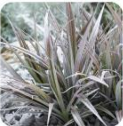
ASTELIA X NERVOSA 'RED SHADOW' ASTELIA RED SHADOW