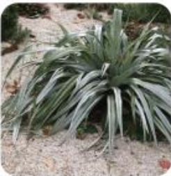
ASTELIA CHATHA 'SILVER SHADOW' SILVER SPEAR