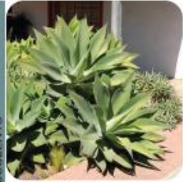
AGAVE ATTENUATA FOXTAIL AGAVE