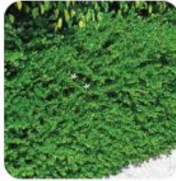
CARISSA MACROCARPA 'TUTTLE' DWARF NATAL PLUM