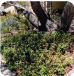
RIBES VIBURNIFOLIUM CATALINA CURRENT