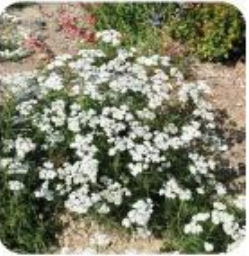
ACHILLEA MILLEFOLIUM COMMON YARROW