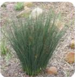
JUNCUS PATENS 'ELK BLUE' ELK BLUE CALIFORNIA GRAY RUSH