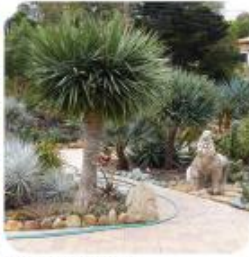
DRACAENA DRACO DRAGON TREE