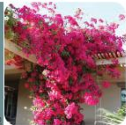
BOUGAINVILLEA 'BK' BARBARA KARST BOUGAINVILLEA