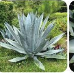
AGAVE AMERICANA CENTURY PLANT