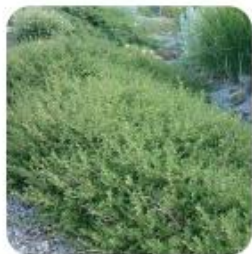
COPROSMA X KIRKII DWARF MIRROR PLANT