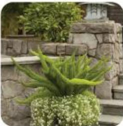
ASPARAGUS DENSIFLORUS 'MYERS' FOXTAIL FERN