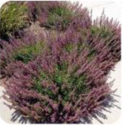
TEUCRIUM CHAMARDRYS GERMANDER