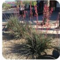
HESPERALOE PARVIFLORA RED YUCCA