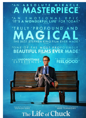
March 16 Life of Chuck