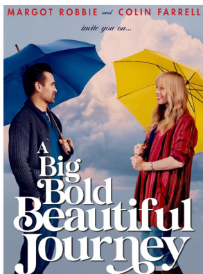
January 19 Big Bold Beautiful Journey