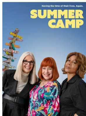
February 9 Summer Camp