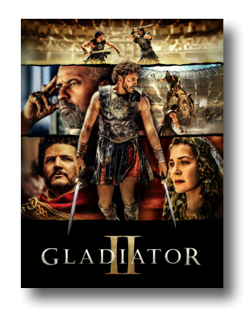
July 28 Gladiator II

FREE SHOWINGS AT 2 AND 7 P.M. DOORS OPEN AT 1:30 AND 6:30 P.M.