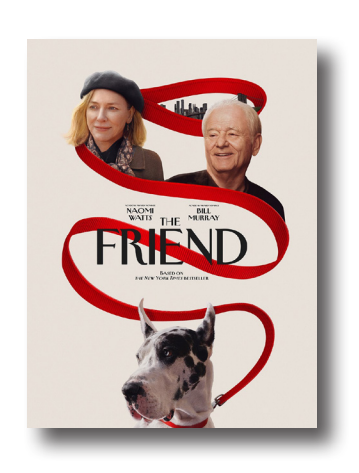
June 23 The Friend