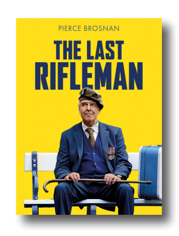
June 16 The Last Rifleman