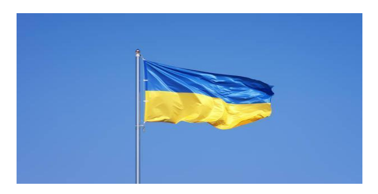
Friday, April 8, 10:00 a.m. in Clubhouse 5

Sponsored by NCJW, ORT, Hadassah, Shalom Club, LW Friends of OC Federation, and RTLW