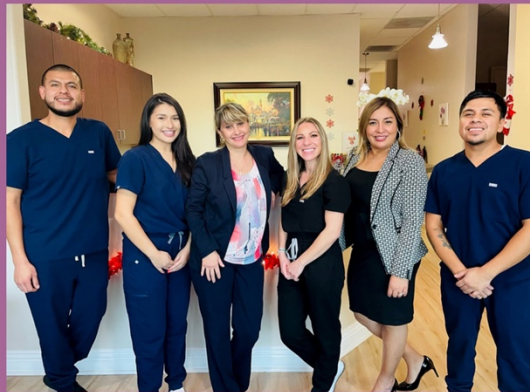
Your ND Dental Team

W9HGC MEMBERS RECEIVE 10% OFF ALL SERVICES