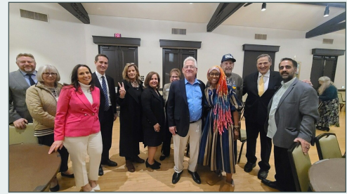
January Candidate Forum

Watch this fascinating program Sundays in February at 3:30 p.m.