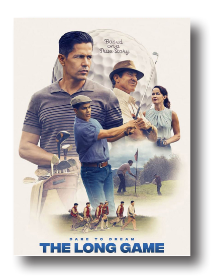
November 18 The Long Game

FREE SHOWINGS AT 2 AND 7 P.M. DOORS OPEN AT 1:30 AND 6:30 P.M.