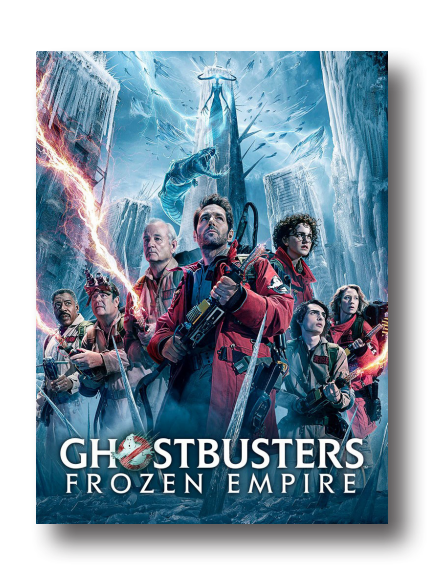
October 21 Ghostbusters: Frozen Empire