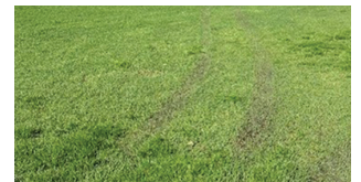
Golf carts driven on wet turf cause damage.