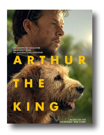
December 16 Arthur the King

FREE SHOWINGS AT 2 AND 7 P.M. DOORS OPEN AT 1:30 AND 6:30 P.M.