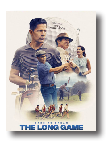
November 18 The Long Game