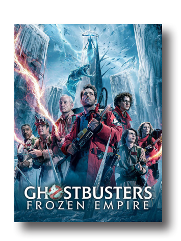
October 21 Ghostbusters: Frozen Empire