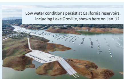
Low water conditions persist at California reservoirs, including Lake Oroville, shown here on Jan. 12.