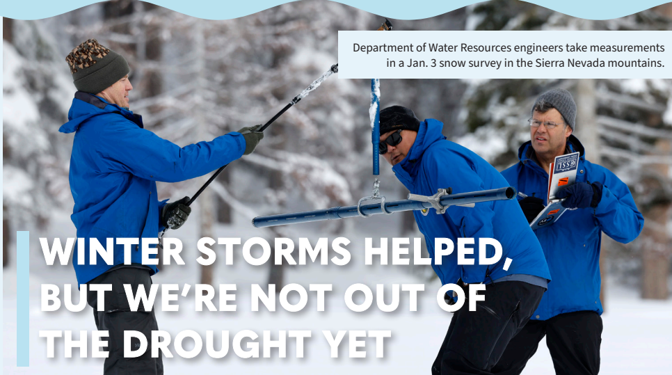
Department of Water Resources engineers take measurements in a Jan. 3 snow survey in the Sierra Nevada mountains.

SERVING THE PUBLIC, RESPECTING THE ENVIRONMENT