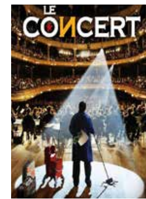
March 28 The Concert PG 13 | 1h 59min | 2009

Movie Times 2 p.m. and 6 p.m. The 2 p.m. movie will have subtitles.