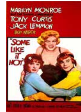
March 7 Some Like it Hot N/R | 2h 1min | 1959