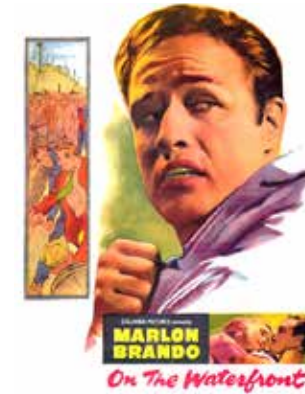
March 21 On the Waterfront N/R | 1h 48min | 1954