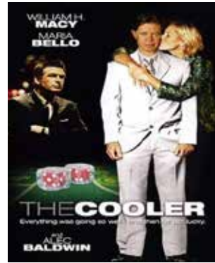
March 10 The Cooler R | 1h 41min | 2003