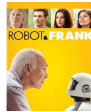
March 14 Robot & Frank PG-13 | 1h 29min | 2012