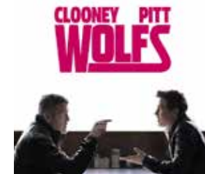
March 24 Wolfs R | 1h 48min | 2024