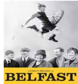
March 17 Belfast PG-13 | 1h 38min | 2021