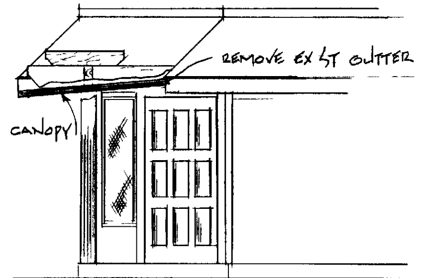
FRONT ELEVATION SCALE 1/4" = 1'-0"