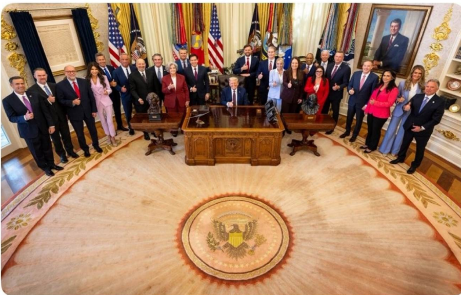
President Trump's Cabinet